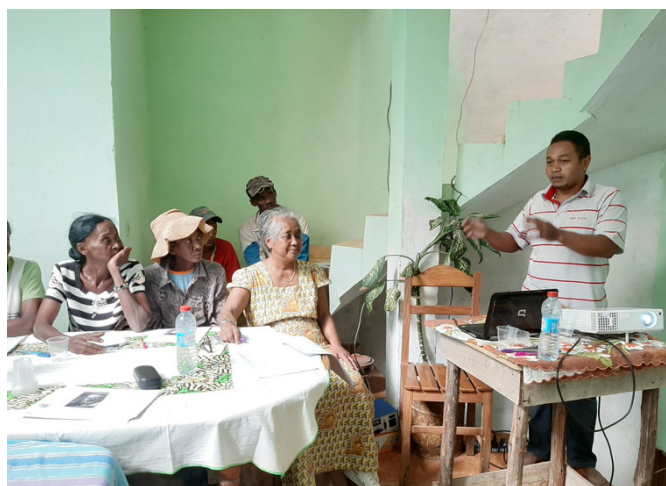
Cooperative's members during classroom training

Finally, the avian epidemic in the region led to the loss of part of the purchased chicks' flock and therefore determined further delays in the final stage of raising and selling the chickens.