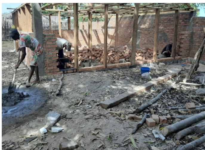
chicken coop construction