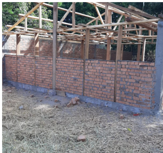
chicken coop construction