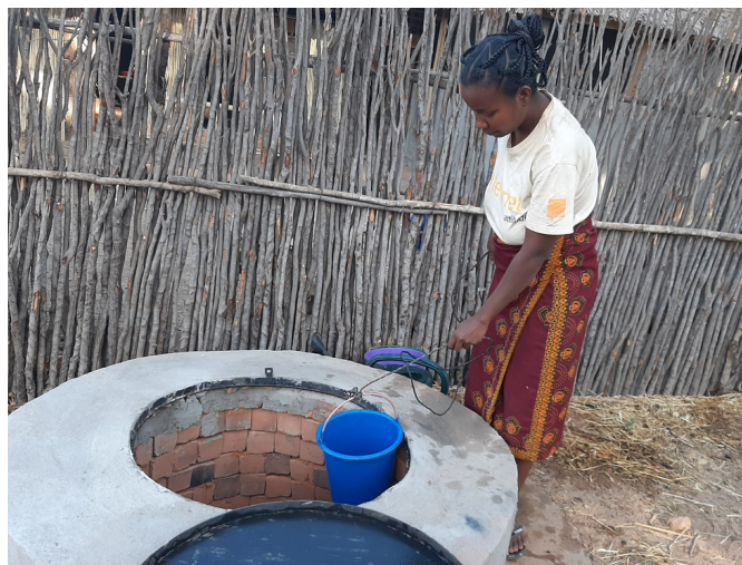
well in operation