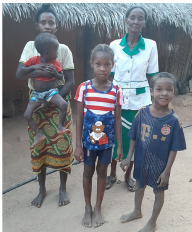
members of the Cooperative with children

Finally, the avian epidemic in the region led to the loss of part of the purchased chicks' flock and therefore determined further delays in the final stage of raising and selling the chickens.