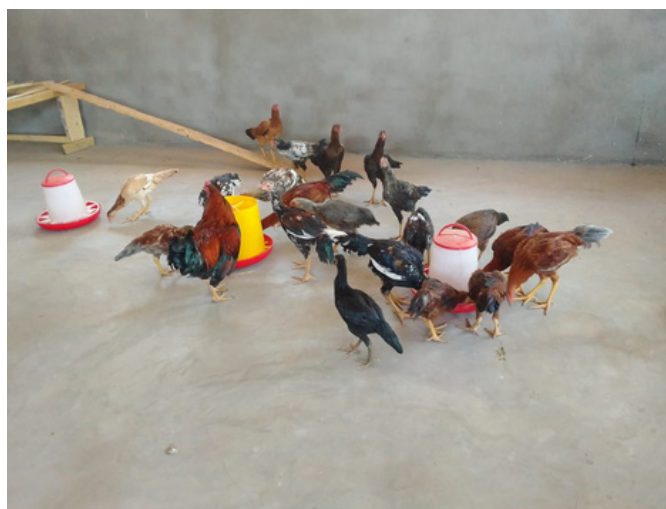
chickens of about 3 months